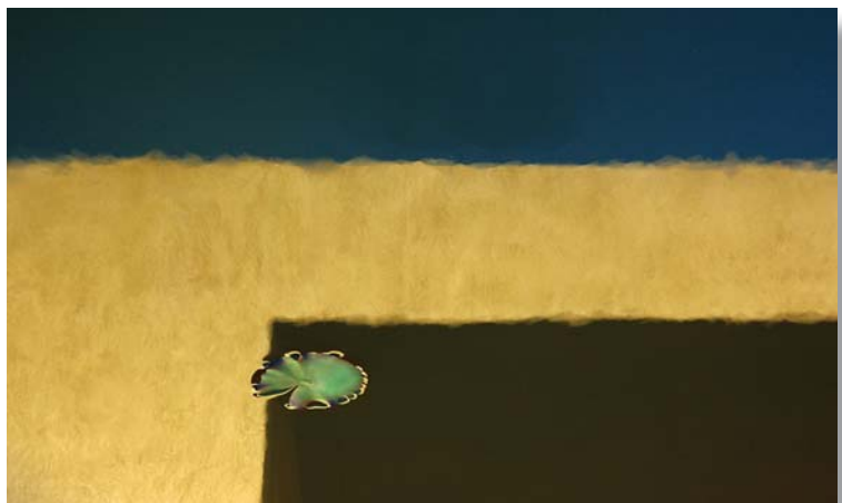
Lily Pond Jerry Heisel “Excellent color and dynamic composition”